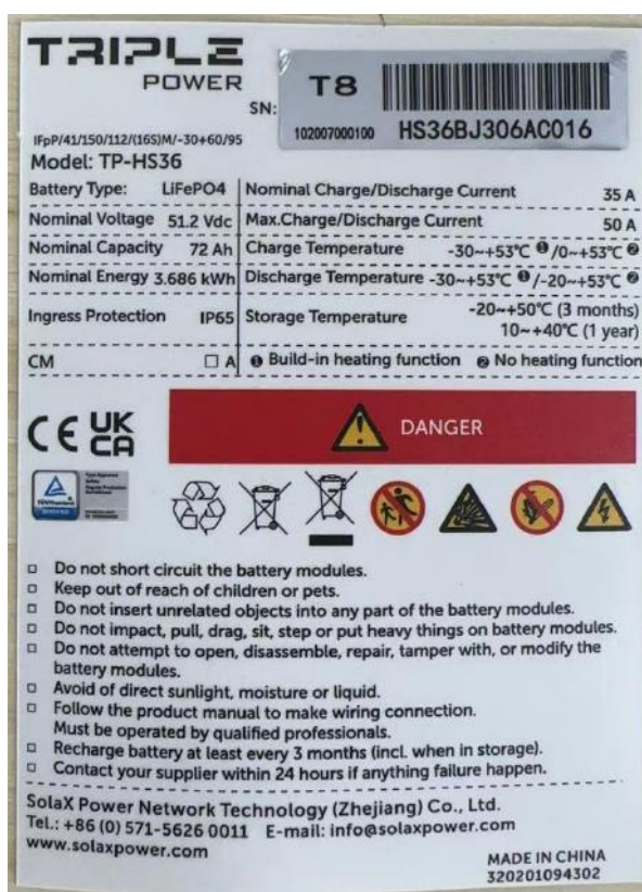
图 5 电池标签 Picture 5 Label of Battery