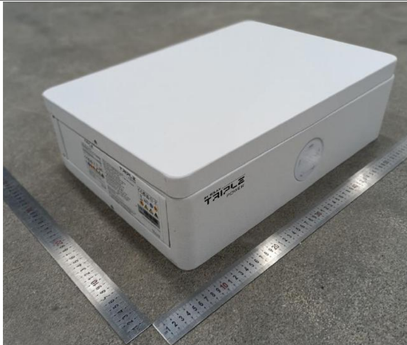
图3 控制盒 Picture 3 Control box