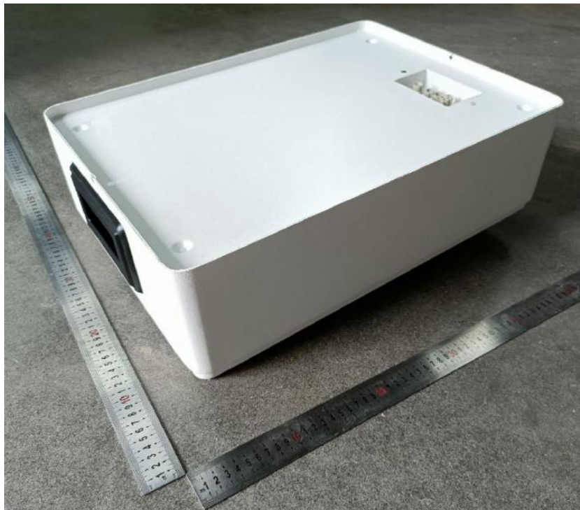
图 2 电池背面 Picture 2 Back view of Battery