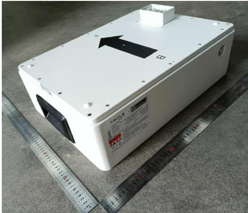
图 1 电池侧面 Picture 1 Side view of Battery