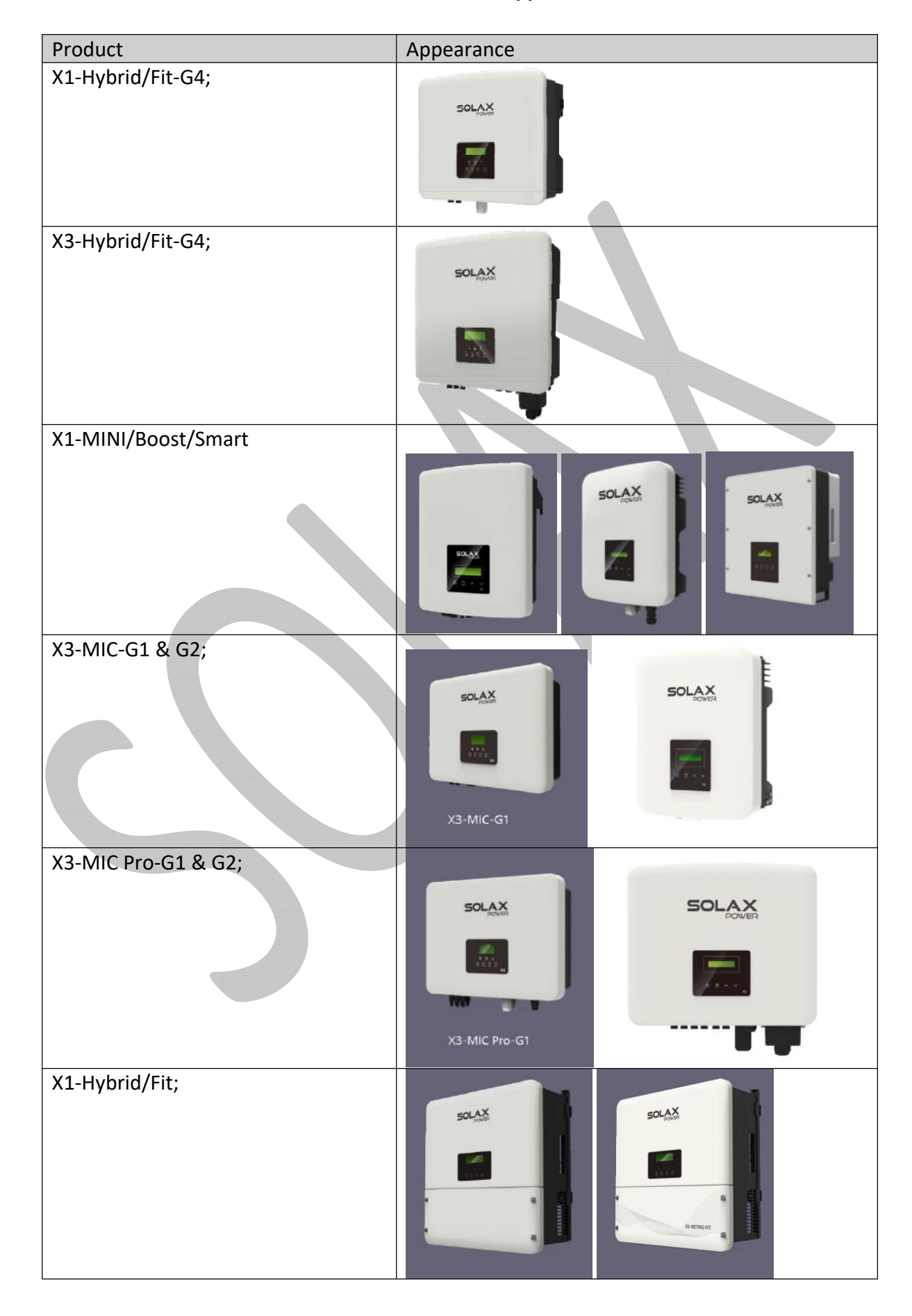
Table 2: Product and Appearance